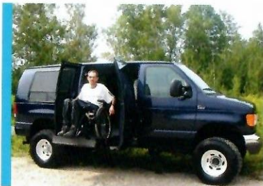
Provide for modified transportation.